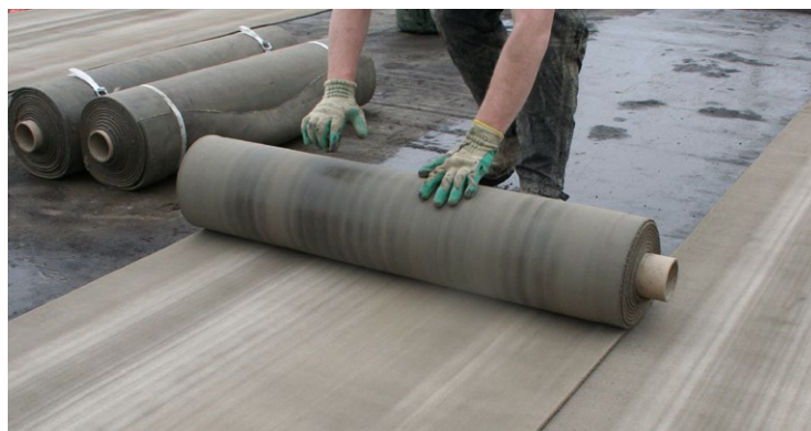
CC Batched Rolls