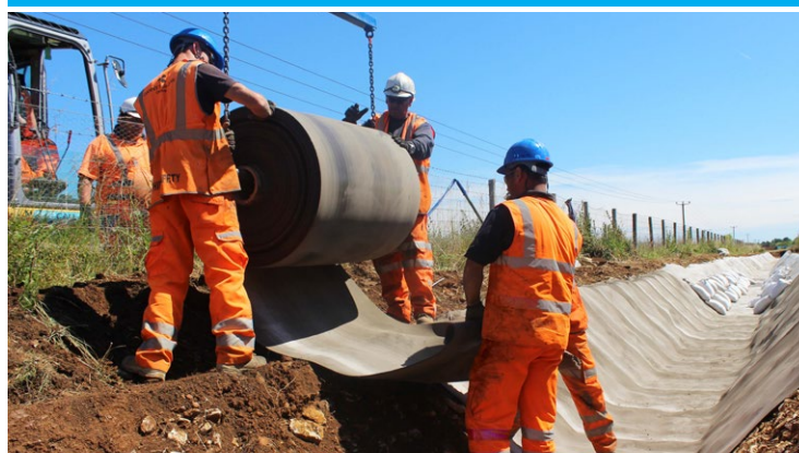
CC Bulk Roll