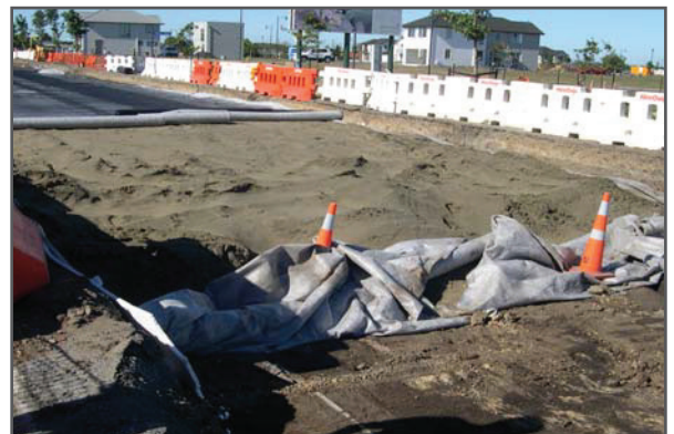
Laying of bidim® nonwoven geotextile, Tensar® TriAx geogrid and black sand