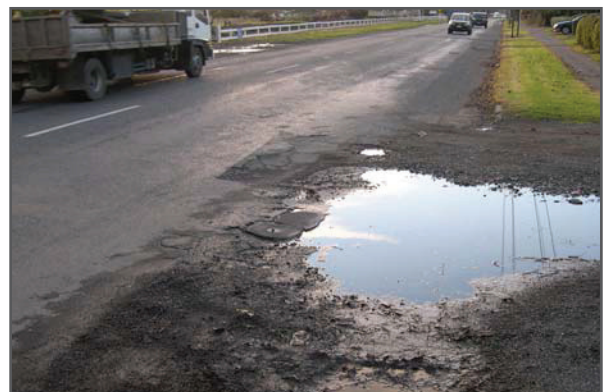
Porchester Rd before construction with pot holes and rutting

Another integral part of the pavement construction was the consideration of the effects of the high ground water table weakening the pavement sub base area. PTO.