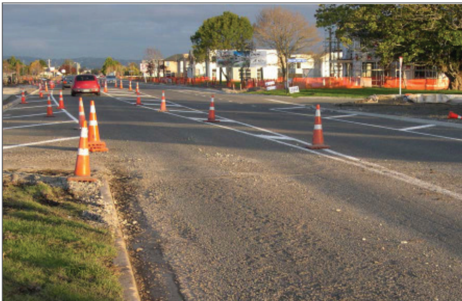
Porchester Rd before construction with pot holes and rutting