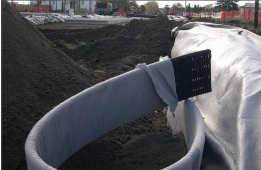
Megaflo® 300 rigid panel drain

Megaflo® 300 rigid panel drain was installed being preferred over standard round pipe drainage as the Megaflo® rigid panel drains a third quicker, has higher internal flow velocities and can be laid on very flat grades without the risk of blocking, again providing definite advantages.