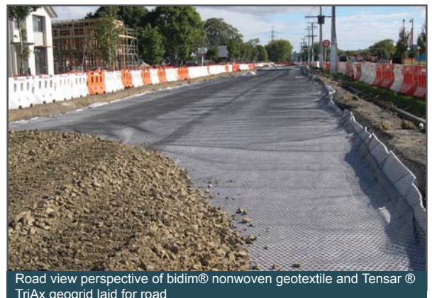
Road view perspective of bidim® nonwoven geotextile and Tensar® TriAx geogrid laid for road

The information contained herein is general in nature. In particular the content herein does not take account of specific conditions that may be present at your site. Site conditions may alter the performance and longevity of the product. Actual dimensions and performance may vary. This document should not be used for construction purposes and in all cases we recommend that advice be obtained from a suitably qualified consulting engineer or industry specialist before proceeding with installation. © Copyright held by Geofabrics New Zealand Ltd. All rights are reserved and no part of this publication may be copied without prior permission.