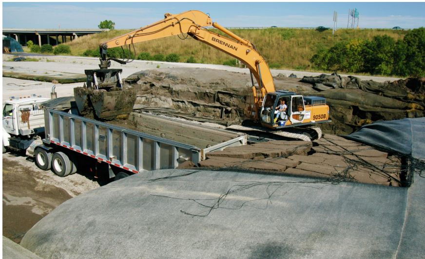
Dewatered sludge being removed from a GEOTUBE ® container with an excavator

GEOTUBE ® units can be sized for large-scale or smaller applications, and effectively contain even hazardous materials, reducing their volume dramatically and saving thousands in disposal costs.