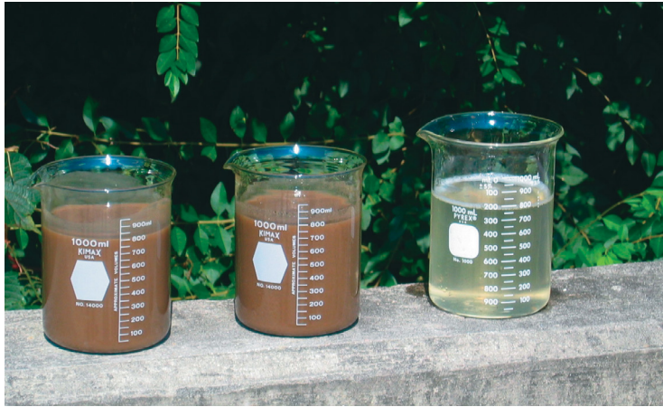
Sludge before (left) and after (right) treatment with GEOTUBE® dewatering technology

Thereby it is one of the most effective solutions available. Volume reduction can be as much as 90%, with high solid levels that make removal and disposal easy.