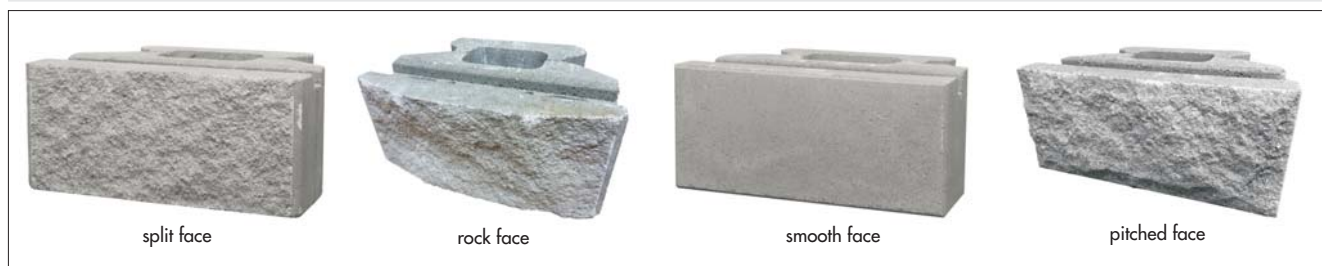
Table 1 Keystone Compac modular concrete block facing units