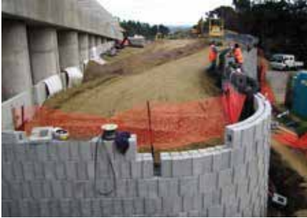
Installing the block facing to specific curve alignments