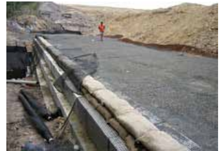
Placement of Miragrid® XT geogrid at base of reinforced fill slope

Because of continual poor weather onsite it became impossible to adequately compact the embankment fill material. Consequently, this material was combined with 2% lime, and this enabled adequate compaction. The lime stabilised embankment fill material was also used as the reinforced fill in the