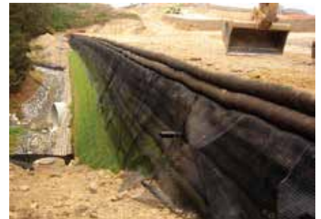
Construction of one of the reinforced fill slopes

reinforced fill slopes with the Miragrid® XT geogrids.