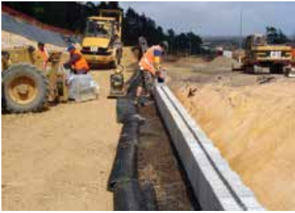
Placing Anchor Landmark® segmental blocks for the wall facing