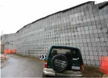
One wall near completion

The construction of reinforced fill slopes at the sides of the embankment earthworks sections enabled the embankment surface area to be maximised, while minimising the amount of land acquisition.